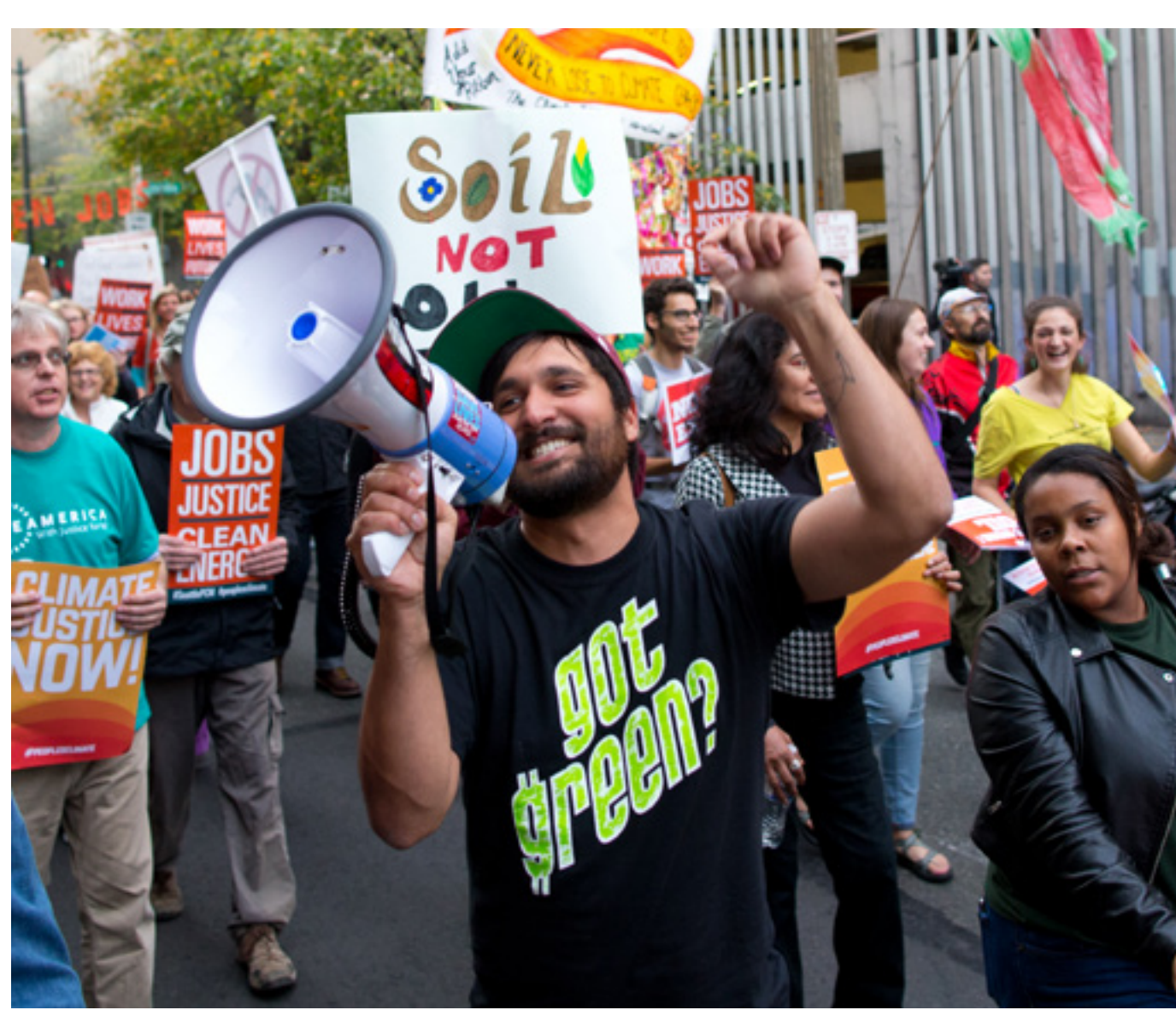
AN ORGANIZER FROM GOT GREEN? RALLIES THE CROWD DURING THE PEOPLE'S CLIMATE MARCH IN SEATTLE, WA. ON OCTOBER 14, 2015.

Netherlands (empowered under TTIP) Power Boiler and Heat Exchanger Manufacturing