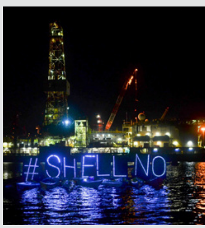
ACTIVISTS DEMONSTRATE AGAINST SHELL IN EVERETT, WA IN JUNE 2015.

Shell already has launched ISDS cases against Nicaragua and Nigeria, the latter of which focused on Shell's offshore oil drilling rights. Both cases have been resolved. Nicaragua, and potentially Nigeria, agreed to a settlement, though details are not publicly available. TTIP would grant Shell the ability to make the U.S. government a next ISDS target if its standard lobby efforts do not succeed in stopping proposed fossil fuel restrictions.