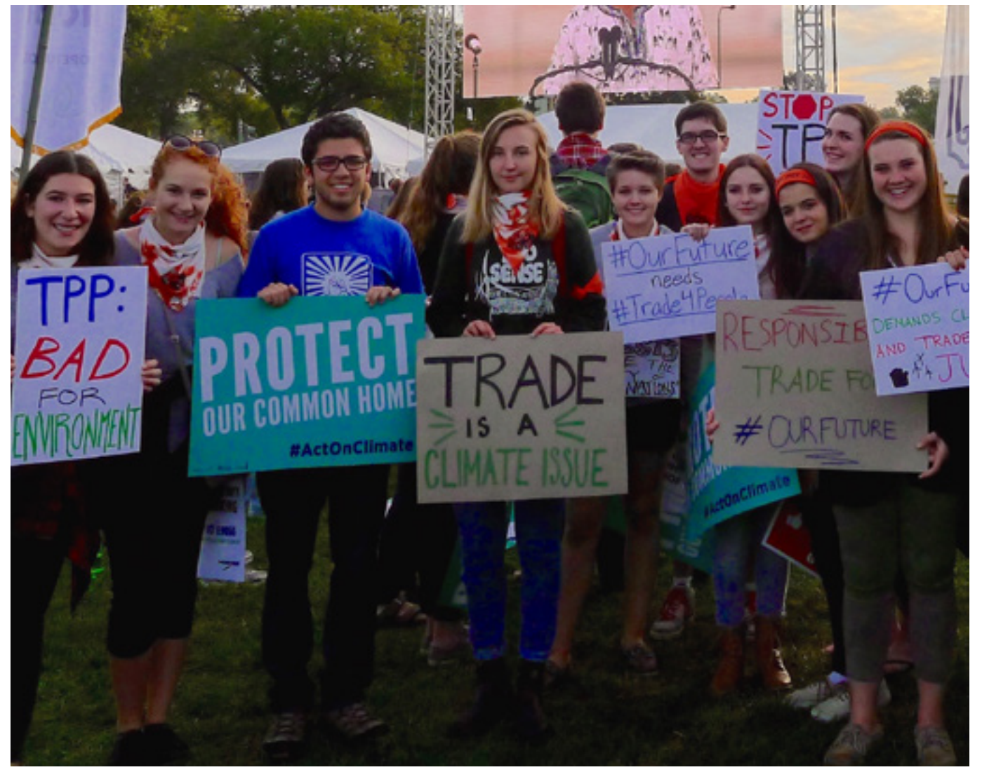
ACTIVISTS RALLY AGAINST THE TPP AND FOR A CLIMATE-FRIENDLY TRADE MODEL IN WASHINGTON, DC, SEPTEMBER 2015.

The fight for climate progress already faces enough obstacles without the additional roadblocks imposed by the TPP and TTIP. Replacing these toxic deals with a new climate-friendly model of trade is an essential component of the growing effort to keep fossil fuels in the ground.