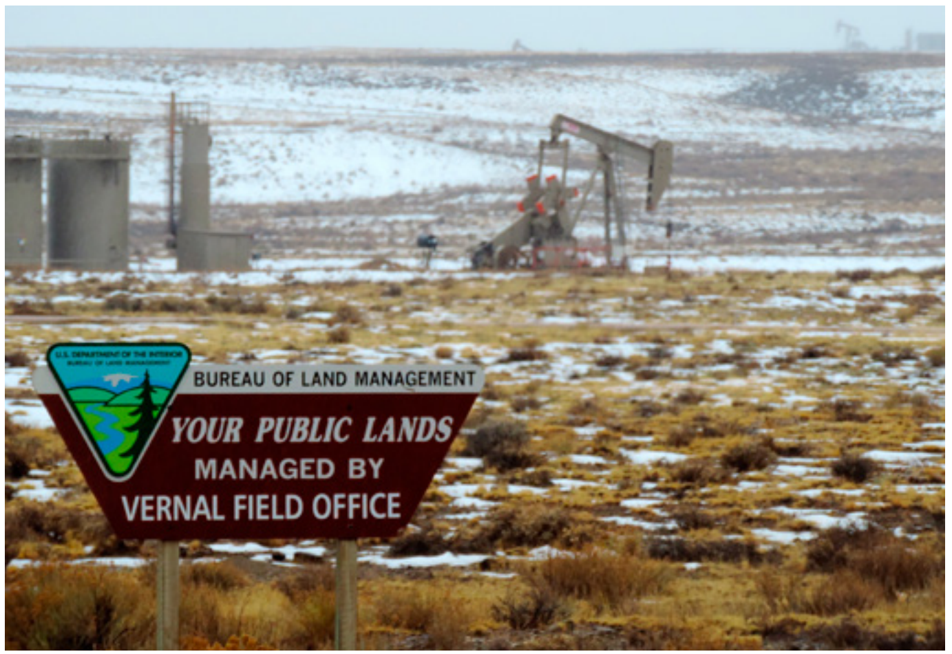
OIL DRILLING ON PUBLIC LAND IN VERNAL, UTAH.

The good news is that 93 percent of these potential greenhouse gas emissions from federal lands are on land that the government has not yet leased to fossil fuel corporations. <sup>216</sup> In September 2015, more than 400 environmental organizations, including the Sierra Club, urged President Obama to "take the bold action needed to stop new federal leasing of fossil fuels, and to keep those remaining fossil fuels—our publicly owned fossil fuels—safely in the ground."<sup>217</sup> Just four months later, the Obama