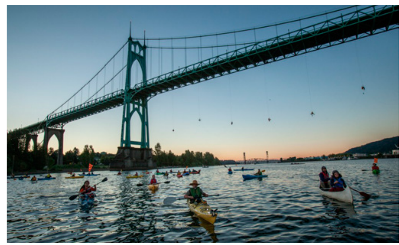
PROTESTERS SUSPEND FROM THE ST. JOHNS BRIDGE IN PORTLAND, OR TO BLOCK A SHELL VESSEL SCHEDULED TO LEAVE FOR THE ARCTIC, JULY 2015.

Further offshore drilling also would exacerbate the climate crisis. As mentioned, scientists and energy experts estimate that about 80 percent of the world's known fossil fuel reserves must stay in the ground if we are to avoid disastrous levels of climate change. A seminal January 2015 study concludes that meeting this goal requires abandoning any