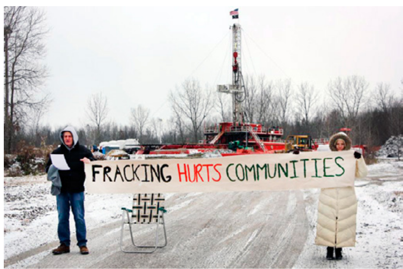
PROTESTERS BLOCK TRUCKS FROM ENTERING A FRACKING SITE IN NILES, OH, NOVEMBER 2013.

Amid the growing evidence of fracking's dangers, communities and environmental organizations in the U.S. are increasingly advocating for government-imposed moratoria, bans, or other restrictions on fracking. After years of grassroots organizing by the broad New Yorkers against Fracking coalition<sup>102</sup> and a seven-year government study on fracking, New York officially banned fracking in 2015,<sup>103</sup> citing "significant