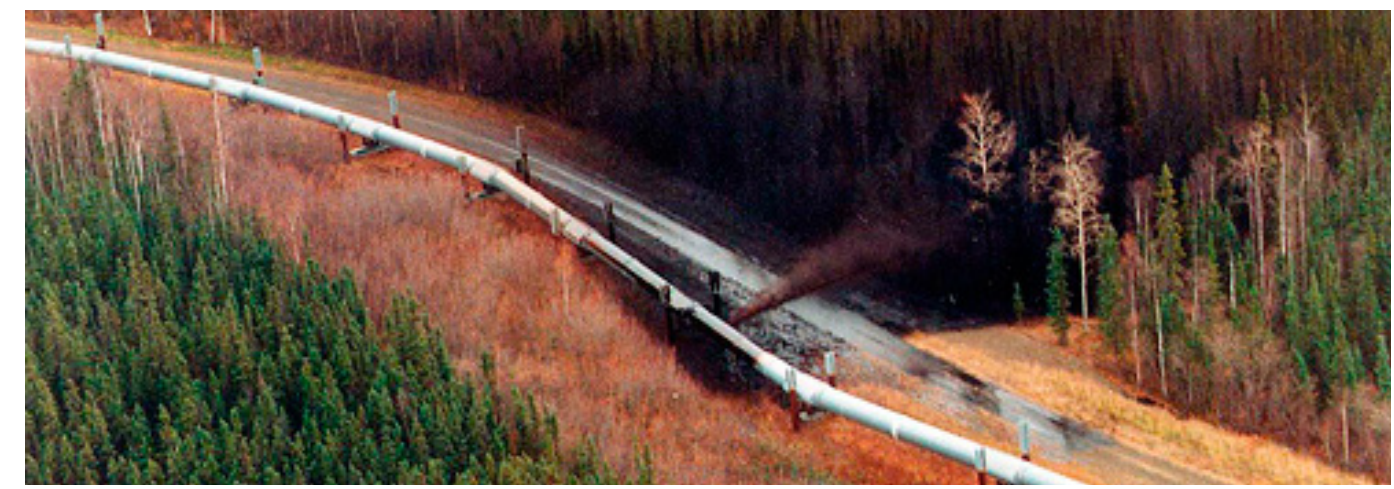
AN OIL PIPELINE IN ALASKA, PARTIALLY OWNED BY BP, LEAKED MORE THAN 6,000 BARRELS OF OIL IN OCTOBER 2001 AFTER A LOCAL RESIDENT SHOT A HOLE IN IT.

Indeed, corporations that would be empowered to launch ISDS cases against the U.S. government