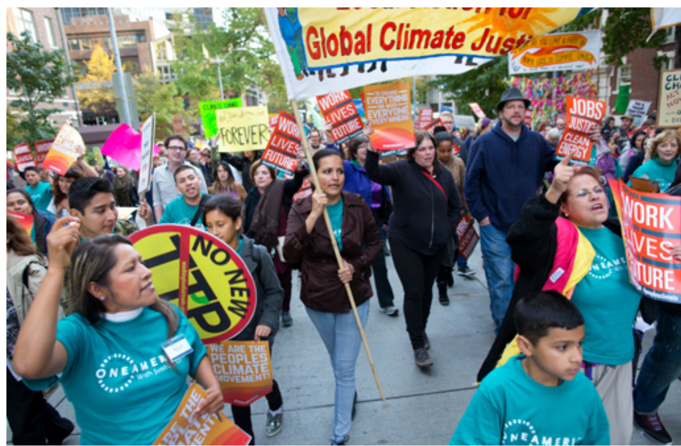
HUNDREDS RALLY DURING THE OCTOBER 2015 PEOPLE'S CLIMATE MARCH IN SEATTLE, WA.

TransCanada's case spotlights the threat that status quo trade rules pose to our ability to transition to clean energy and keep fossil fuels in the ground. The warning comes at a critical moment. Though more than 190 countries committed to tackle climate change in the