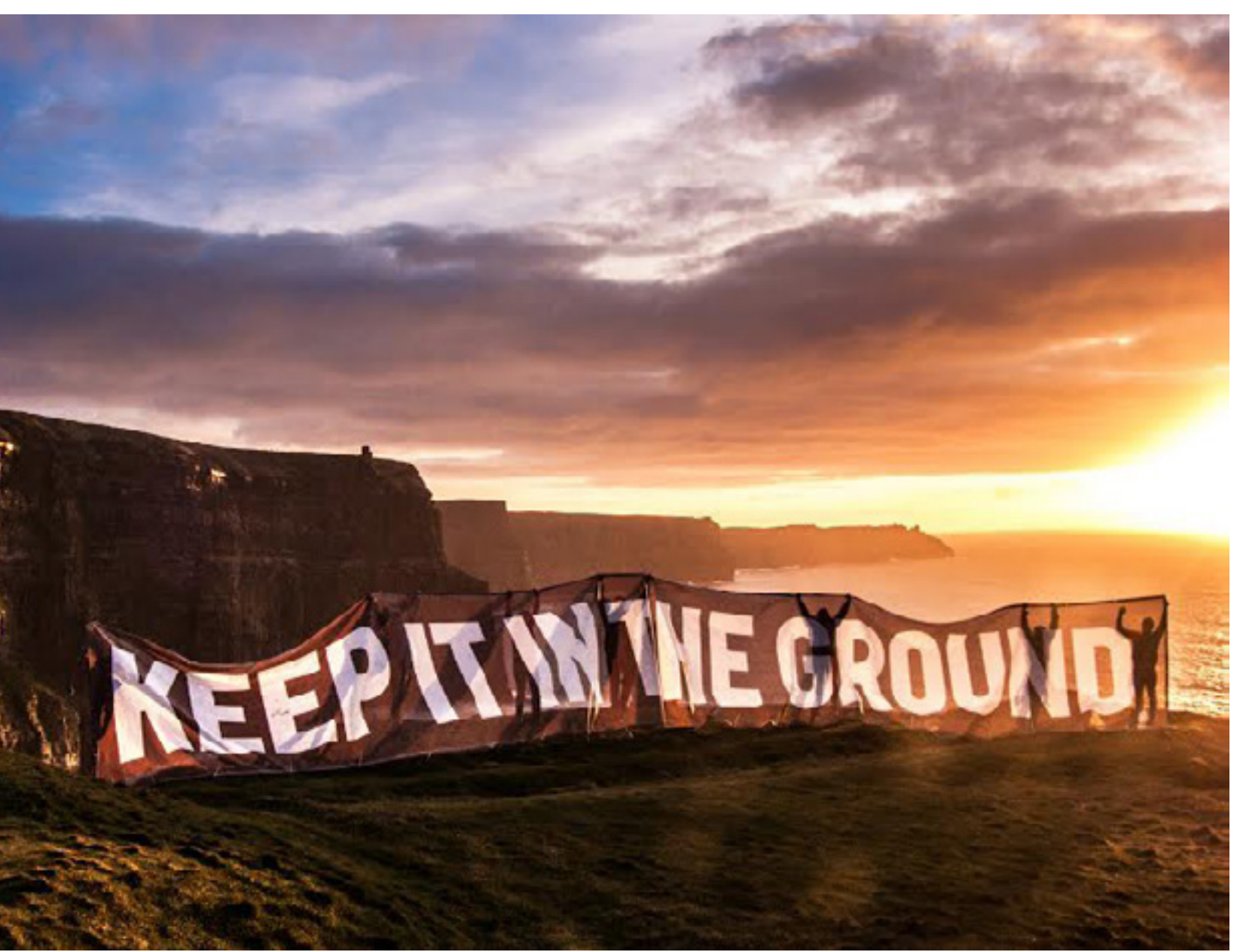
CLIFFS OF MOHER, IRELAND, NOVEMBER 2015.